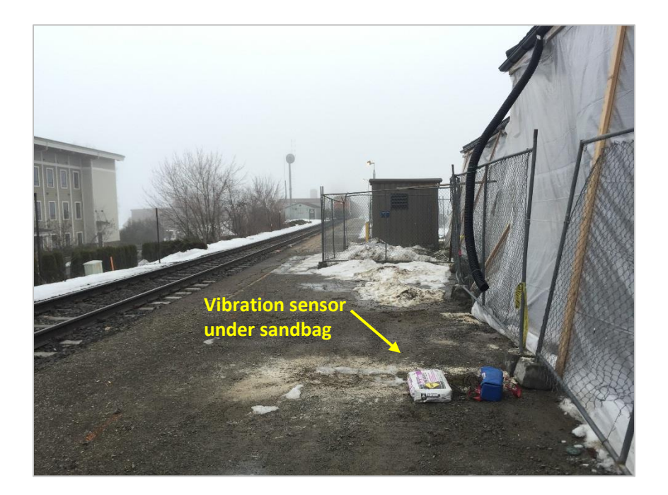
FIGURE 1 VIBRATION MEASUREMENT 19 FT FROM TRACK CENTERLINE

Mr. Dreyfus deployed one MiniMate Plus 19 feet from the existing mainline track centerline and the other 29 feet from the centerline. Both instruments were places in shallow, smooth-bottomed holes (1 to 2 inches deep) and covered with 50-pound sandbags (see Figure 1). This is a standard way of mounting these instruments and provides good coupling to the ground for the purpose vibration measurements.